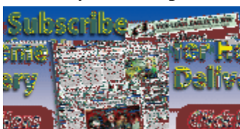
Promo - 170x90 Subscribe Home Delivery PAC Button

© Copyright 2012, pressofAtlanticCity.com, Pleasantville, NJ. Powered by BLOX Content Management System from TownNews.com. [ Terms of Use | Privacy Policy ]