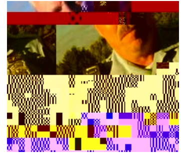
YouTube cop Philip Nace pulled off the street as secur video surfaces